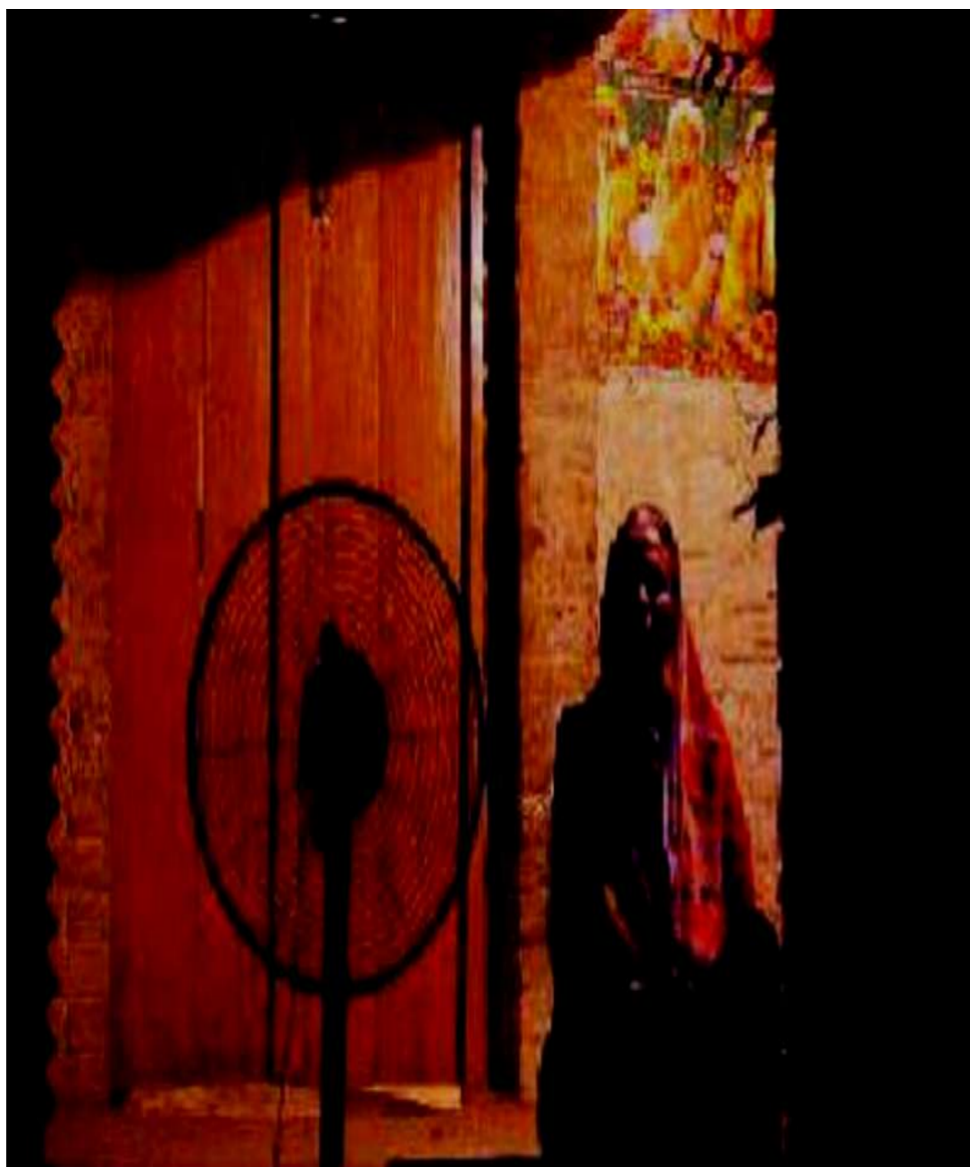
Sheetalkhera in UP becomes one of the 3,000 villages across the country that have been provided electricity only now.