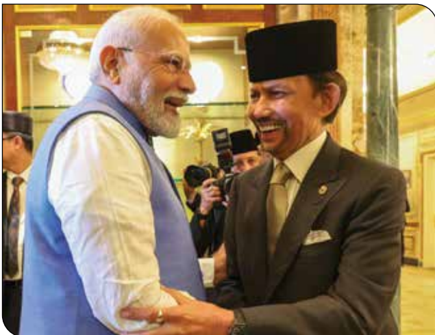
PM Shri Narendra Modi meets His Majesty Sultan Haji Hassanal Bolkiah in Brunei on September 04, 2024