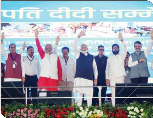
PM Shri Narendra Modi attends the 'Lakshmi Didi Sammelan' at Jalgaon in Maharashtra on August 25, 2024