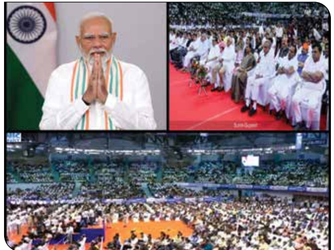
PM Shri Narendra Modi addressing at the launch of 'Jal Sanchay Jan Bhagidari initiative' on September 06, 2024