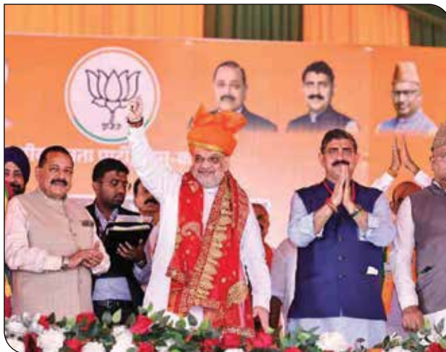
Union Home & Cooperation Minister Shri Amit Shah receiving the greetings at 'Karyakarta Sammelan', Paloura, Jammu on 07 September 2024