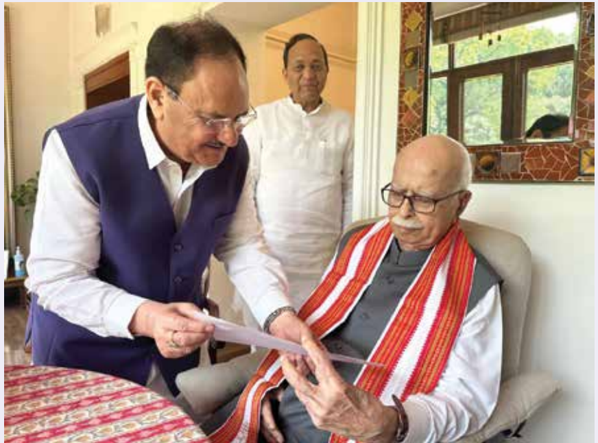
BJP National President Shri JP Nadda visited BJP senior leader Bharat Ratna Shri Lal Krishna Advani ji at his residence in New Delhi and presented him a copy of renewal of his membership under 'Bharatiya Janata Party - National Membership Drive' on 05 September, 2024

Reflecting on the historical journey of the BJP, the PM recalled the early days when party workers, with unwavering dedication, would paint lotus symbols on walls, signifying their commitment and belief. "We are those people who painted lotus on the walls with devotion because we believed that the lotus painted on the walls