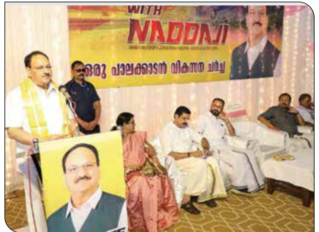
BJP National President Shri JP Nadda addressing and interacting a gathering of eminent personalities of various fields at Palakkad in Kerala on 01 September 2024