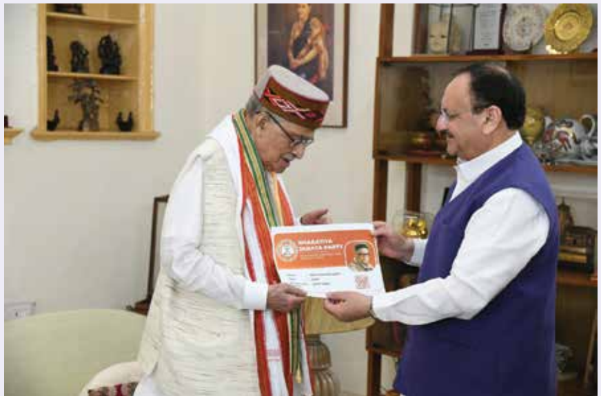
BJP National President Shri JP Nadda visited senior BJP leader Dr. Murli Manohar Joshi ji at his residence in New Delhi and giving a copy of renewal of his membership under 'Bharatiya Janata Party - National Membership Drive' on 05 September, 2024

will someday be painted on the hearts too," he said. He added that even today, in some states, Bharatiya Janata Party workers