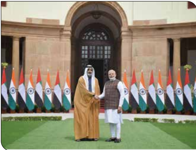
PM Shri Narendra Modi meets the Crown Prince of Abu Dhabi, Sheikh Khalid bin Mohamed bin Zayed Al Nahyan at Hyderabad House in New Delhi on September 09, 2024