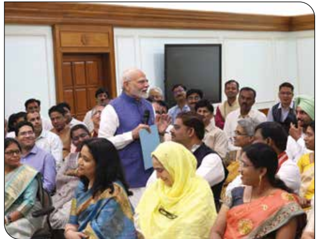
PM Shri Narendra Modi interacting with National Awardee Teachers 2024 in New Delhi on September 06, 2024