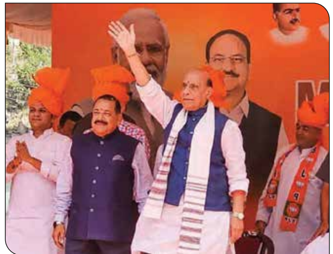
Defence Minister Shri Rajnath Singh along with Union MoS Shri Jitendra Singh during an Assembly election meeting in Ramban, Jammu & Kashmir on 08 September 2024