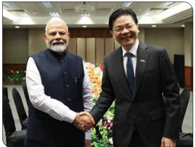
PM Shri Narendra Modi meets the Prime Minister of Singapore, Mr. Lawrence Wong in Singapore on September 05, 2024