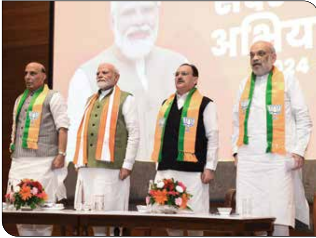
PM Shri Narendra Modi, BJP National President Shri JP Nadda, Union Ministers Shri Rajnath Singh and Shri Amit Shah at the launching of 'BJP National Membership Campaign- 2024' at BJP National Headquarters in New Delhi on 02 September, 2024