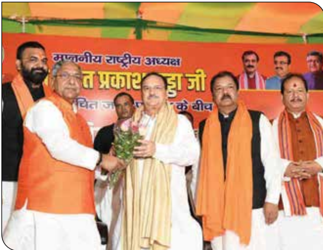
Bihar BJP welcomes BJP National President Shri JP Nadda at the Sadasyata Abhijan Karyakram in Patna, Bihar on 07 September 2024