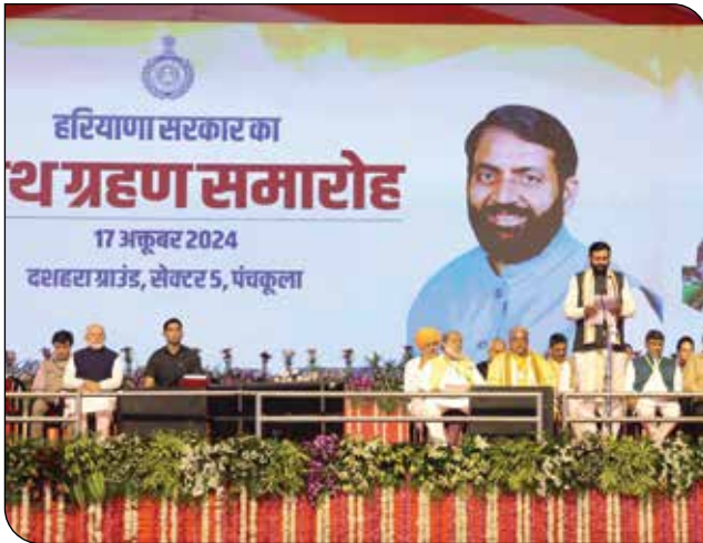
PM Shri Narendra Modi at the Oath Taking Ceremony of Shri Nyab Singh Saini at Panchkula in Haryana on 17 October, 2024