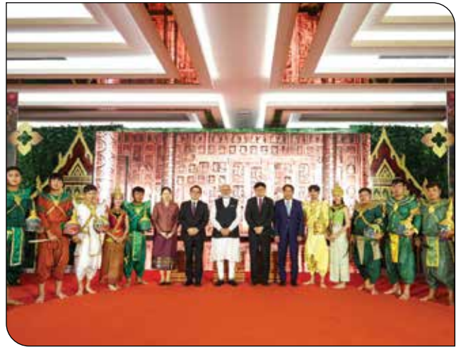
PM Shri Narendra Modi in a group photograph during regional adaptation of Ramayana Performance at Vientiane in Laos on October 10, 2024