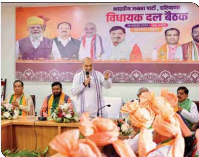
Union Home and Cooperation Minister Shri Amit Shah addressing the Legislature Party Meeting at Panchkula in Haryana on 16 October, 2024