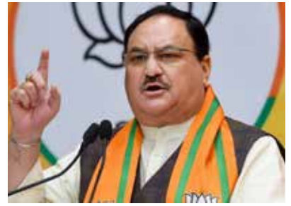
'Top leadership of Congress is in shock due to continuous defeats'