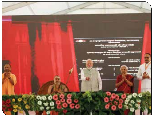
PM Shri Narendra Modi inaugurates RJ Sankara Eye Hospital at Varanasi in Uttar Pradesh on October 20, 2024