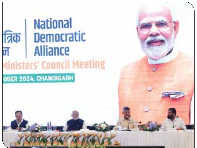
PM Shri Narendra Modi chairing a meeting of NDA Chief Ministers and Deputy Chief Ministers in Chandigarh on 17 October 2024