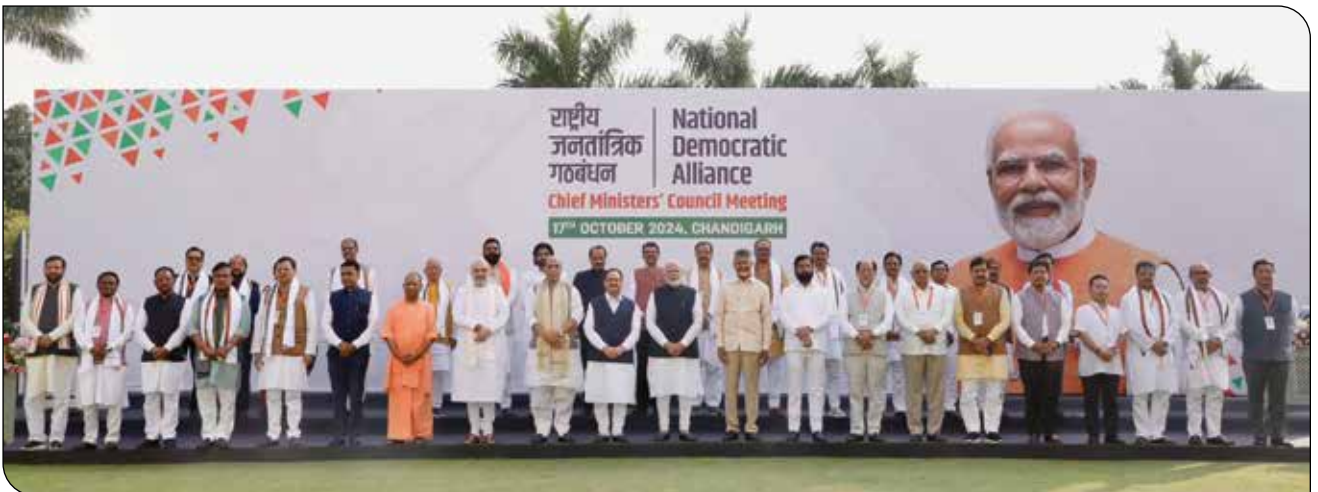
Prime Minister Shri Narendra Modi along with BJP National President and Union Minister Shri JP Nadda, Union Ministers Shri Rajnath Singh and Shri Amit Shah, NDA Chief Ministers and Deputy Chief Ministers attending the NDA Chief Ministers' Council Meeting in Chandigarh on 17 October, 2024