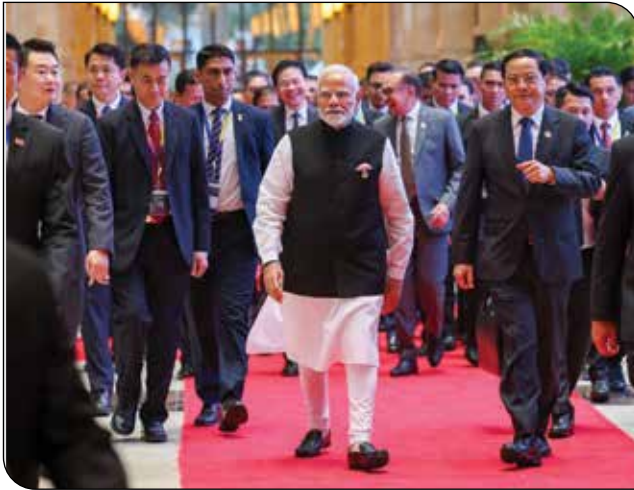
PM Shri Narendra Modi at the India-ASEAN Summit at Vientiane in Laos on October 10, 2024