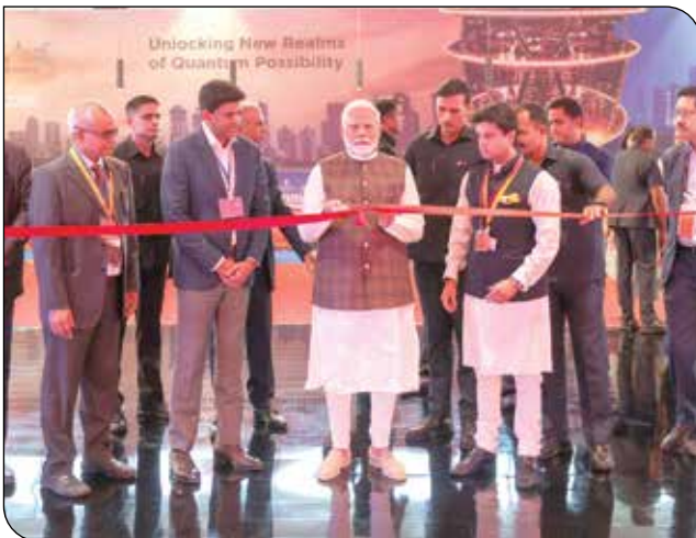
PM Shri Narendra Modi inaugurates ITU World Telecommunication Standardization Assembly at Bharat Mandapam in New Delhi on October 15, 2024