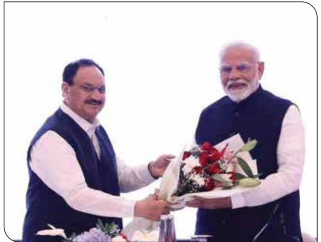
BJP National President and Union Minister Shri JP Nadda welcoming PM Shri Narendra Modi to the NDA Chief Ministers' Council Meeting in Chandigarh, Haryana on 17 October, 2024