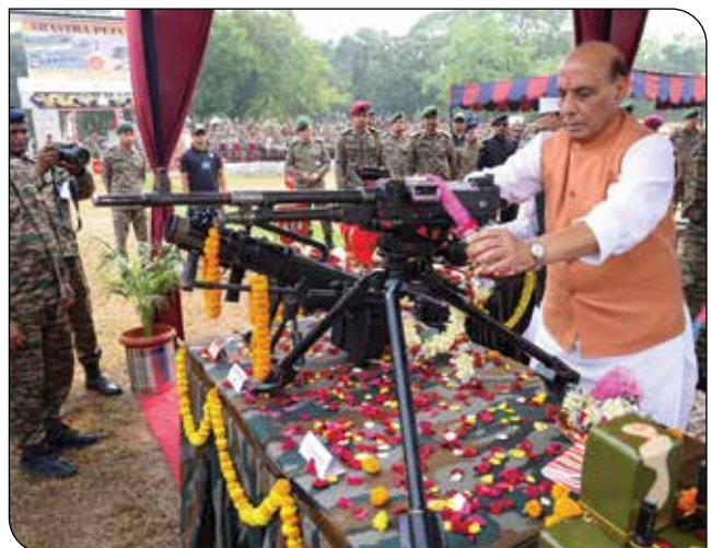
Defence Minister Shri Rajnath Singh worshipping weapons on the occasion of Vijayadashami at 33 Corps Headquarters in Sukna, Darjeeling on 12 October, 2024