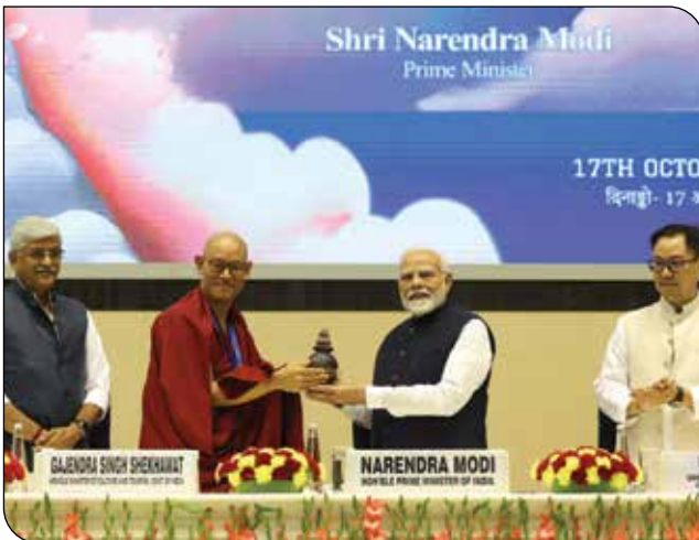
PM Shri Narendra Modi participates in celebration of International Abhidhamma Divas and recognition of Pali as a classical language at Vigyan Bhavan in New Delhi on October 17, 2024