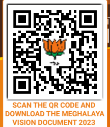
SCAN THE QR CODE AND DOWNLOAD THE MEGHALAYA VISION DOCUMENT 2023