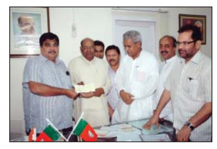
Launching Aajeevan Sankalp Yojana in New Delhi.