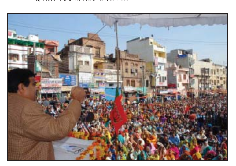
परेड ग्राउंड (जदयू) में राष्ट्रीय एकता परिषद की जनसभा

Rashtriya Ekta Parishad at Parade ground Jammu