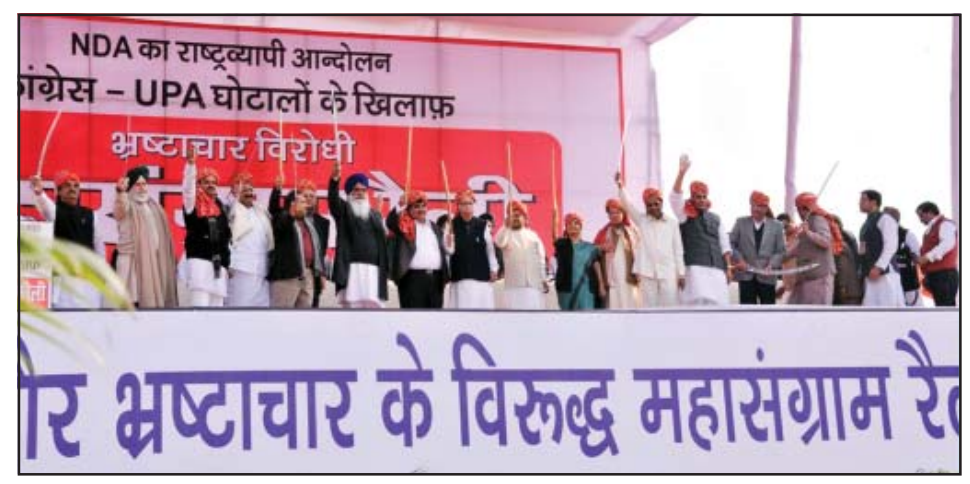
Bhrastachar Virodhi Mahasangram rally in New Delhi नई दिल्ली में भ्रष्टाचार विरोधी महासंग्राम रैली

Rashtriya Ekta Parishad at Parade ground Jammu