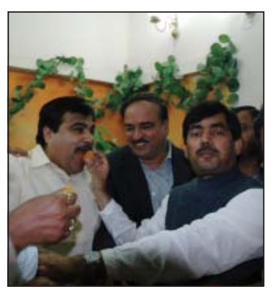
बिहार-विधानसभा चुनाव में जीत का जश्न