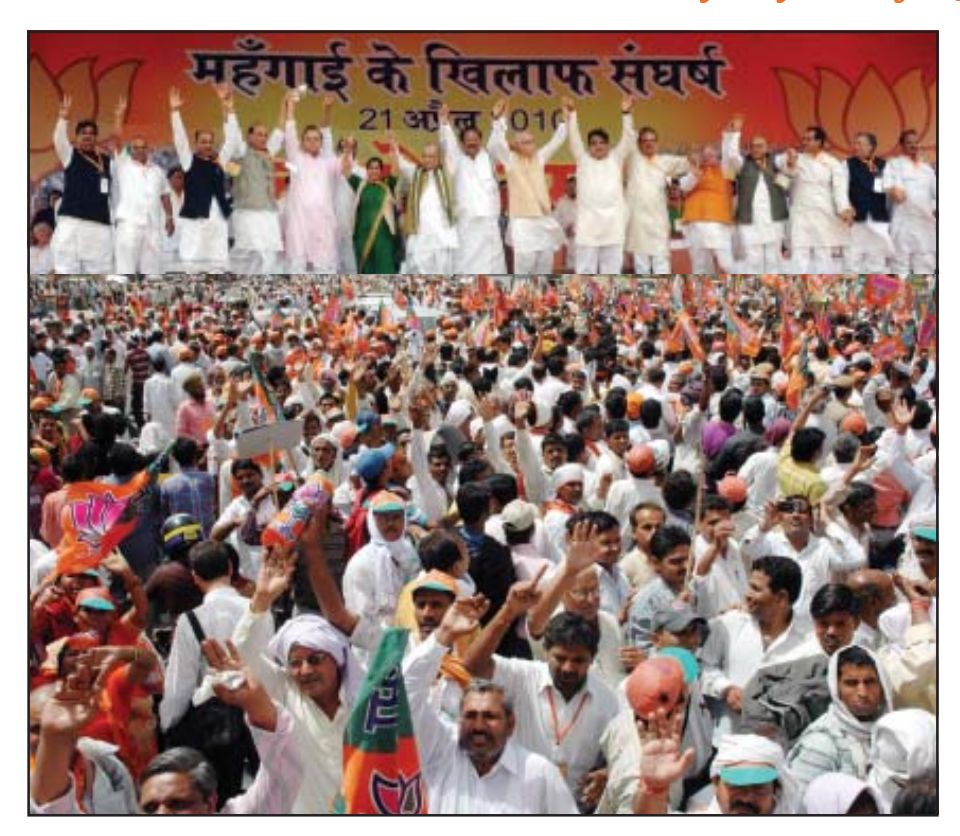
Massive BJP Rally against mehangai at Ramlila Ground in New Delhi रामलीला मैदान, नई दिल्ली में महंगाई के विरुद्ध विशाल रैली