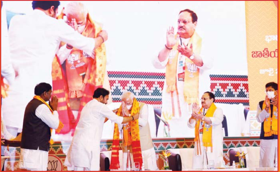
Union Minister Shri G.Kishan Reddy welcoming the Prime Minister, Shri Narendra Modi at the inaugural session of the 'National Executive Meeting' held in Hyderabad, Telangana on July 02-03, 2022