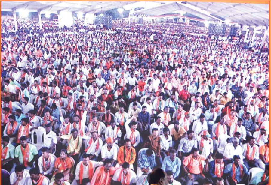
A panoramic view of 'Vijay Sankalp Sabha' held on 3rd July, 2022 at Hyderabad, Telangana